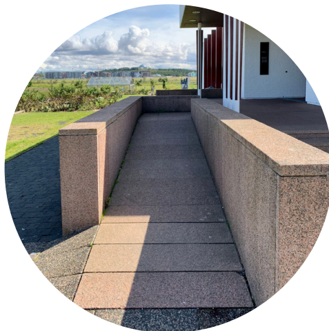
Ramp for wheelchair or walker access.

Now, you can walk up to the main entrance using the stairs or the ramp. The main door is facing the pond you can't miss it.