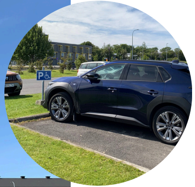
View of the accessible parking space.

When you arrive at the Nordic House there is a big free parking lot outside where you can park your car or bike.