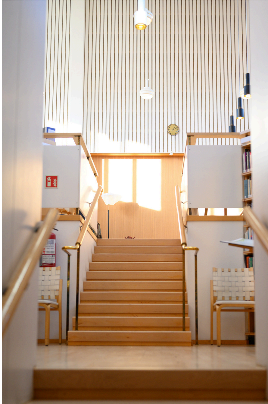
This are the stairs to access downstairs to the mezzanine (9 steps) and then to the children's library (9 steps extra).